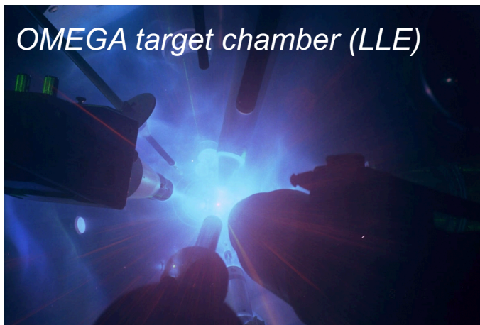
OMEGA target chamber (LLE)

Hydrodynamics of ICF, astrophysics, dynamos